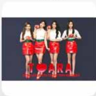
Little Apple T-ARA