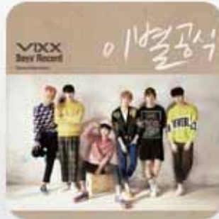
Boys Record (Single A... VIXX