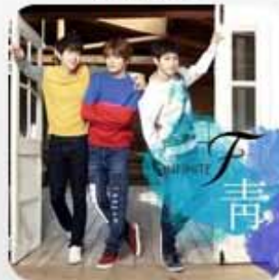
Infinite F 1st Single... Infinite F